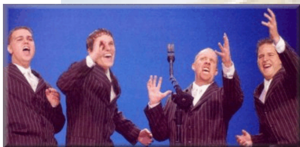
VOCAL SPECTRUM International Champs-2006