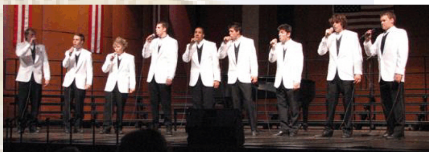
BACKBEAT Northville High School