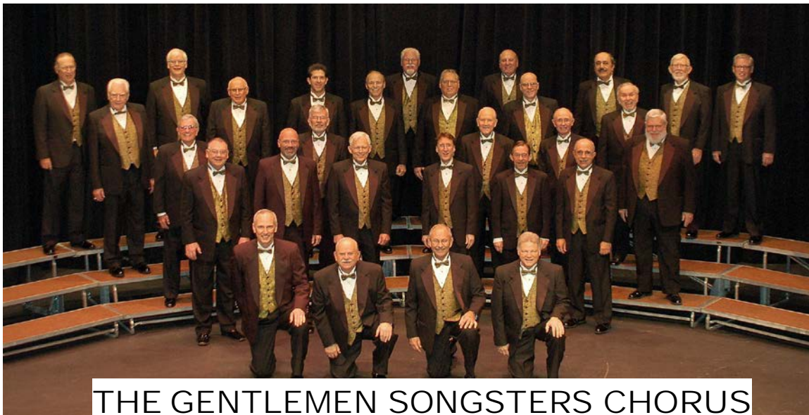
THE GENTLEMEN SONGSTERS CHORUS