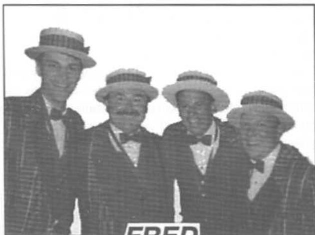
FRED 1997 Silver Medalists